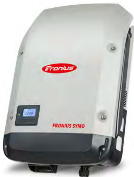
Central Inverter (1 per solar system)

2. The second main component of a solar power system installation is the inverter , which can be either a string inverter (around the size of a briefcase), or a microinverter which is approximately the size of a paperback book.