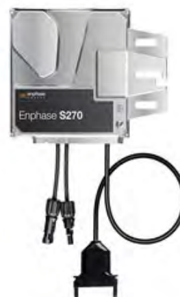
Micro-inverter (1 per solar panel)

A string inverter is installed on a wall and all the solar panels connect to it. A microinverter goes on the back of each individual solar panel.