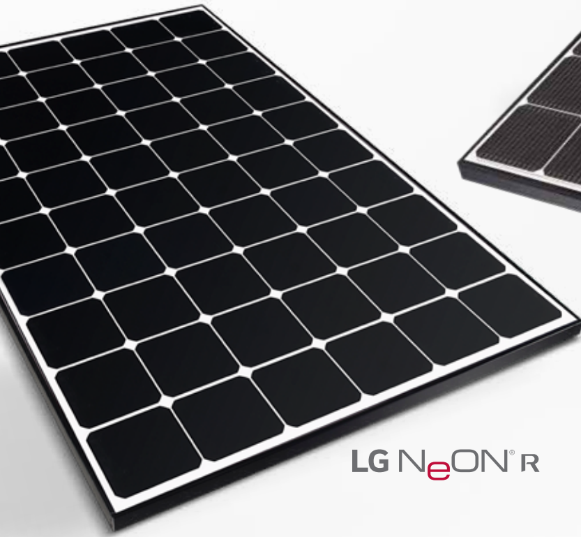
LG NeON ® R