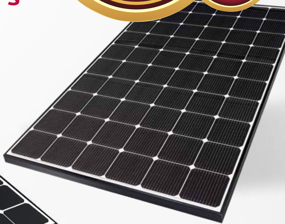
LG NeON ® 2