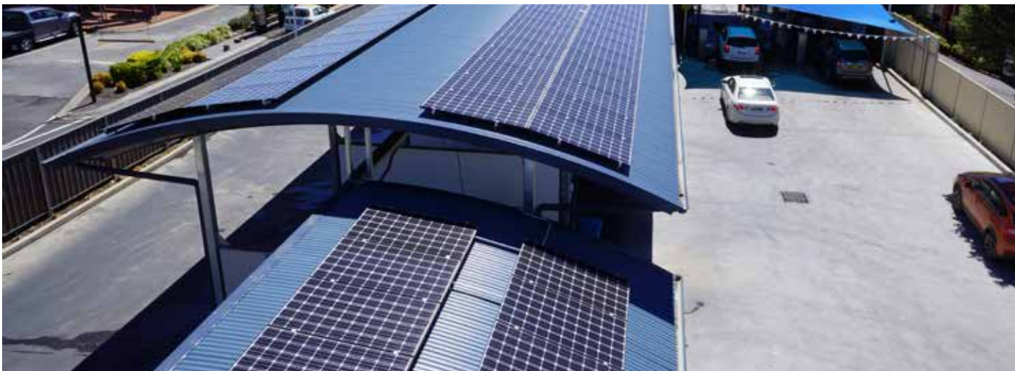
40 kW LG NeON system, carwash, Bathurst

Subject to the terms in this document, for modules manufactured from October 2017 onwards, being the A5 and V5 model range, LG will for a period of twenty five (25) years from date of original install authorise a free of charge repair or replacement (at LG's discretion) of the module, if in LG's opinion, it needs repair or replacement because of a manufacturing or materials defect appearing within, and notified to LG in accordance with this warranty. This warranty is only applicable to modules under normal applications, installations, use and service conditions.