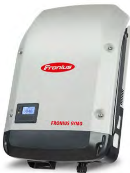
String Inverter (1 per solar system)

2. The second main component of a solar power system installation is the inverter , which can be either a string inverter (around the size of a briefcase) or microinverters, which are approximately the size of a paperback book.