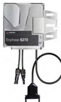
Micro-inverter (1 per solar panel)

A string inverter is installed on a wall and all the solar panels connect to it. A microinverter goes on the back of each individual solar panel.