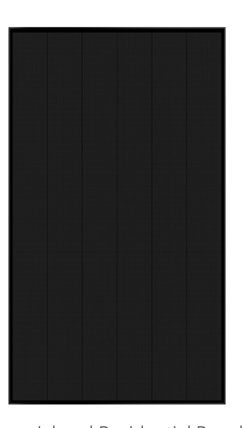
SunPower Performance 3 Commercial and Residential Panels